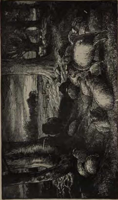
"Forth in the pleasing spring." Page 52.